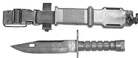
U.S. M9 BAYONET 24

Although anything with a blade can be used as an offensive or defensive arm, World War II saw the introduction of the M4 bayonet, which was specifically designed to be useful as a handheld weapon. 22 In the post-Cold War era, bayonets were designed to serve not only as fighting knives but also as wire cutters, box cutters, or improvised pry bars. 23